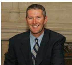
Brian Pallister, M.P., Parliamentary Secretary to the Minister of International Trade and to the Minister of International Co-operation (Portage-Lisgar, MB)

Mr. Pallister was elected to the House of Commons in 2000 and re-elected in 2004 and 2006. He was most recently Chair of the House of Commons Standing Committee on Finance (note: a new Finance Committee Chair will be elected once Parliament resumes in mid-October). Mr. Pallister has a good knowledge of the credit union system having met with Canadian Central representatives on several occasions. Mr. Pallister has also served in provincial politics. He was a member of the Manitoba Legislature from 1992 to 1997 and was appointed Minister of Government Services in 1995.